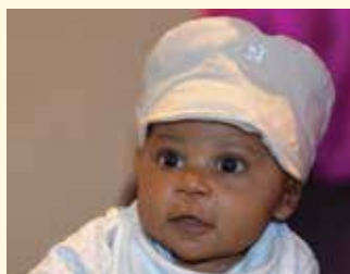
Our BIBS Family