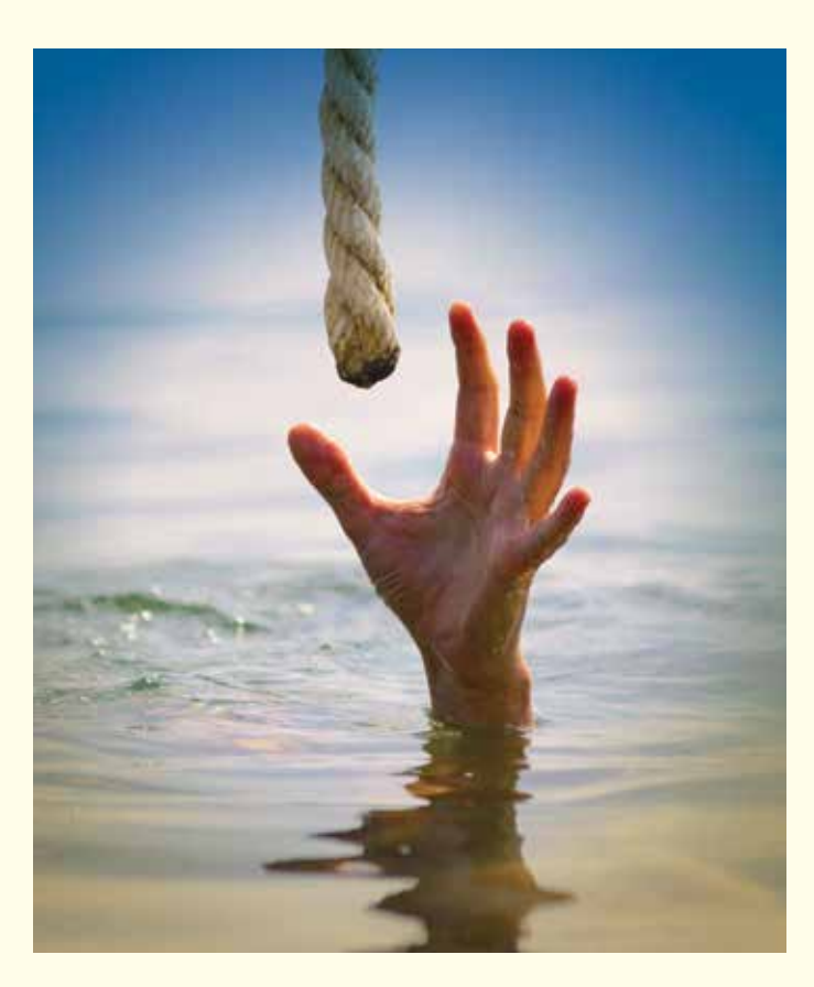
"In my distress, I cried unto the LORD and he heard me! (Psalms 34:4-6)

Suicide is not "the only option", that's an evil thought from the devil. The bible is full of examples of men who reached low points in their lives: King David, Job, the Jailer, Jeremiah all who questioned their life. In their helplessness (feeling they can't do anything about their circumstances, loss of control, inability to cope) they turned to God.