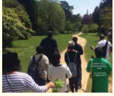
Behold the Beauty of the LORD! Prayer-walk to Heavens Gate