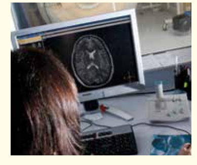
Health Corner - Mini Strokes