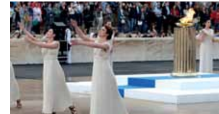
Lighting Ceremony

Still not convinced, that Olympism is a religion? Well, the 2012 ceremony started in the ancient temple of Hera