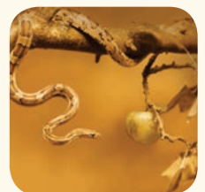
The Devil's Bait