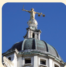
Equalities Act 2010