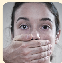
Muzzling The Christian