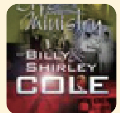
Passion for Souls