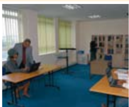
BIBS is Jehovah 's Will