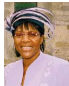
Dean of Studies