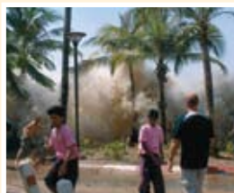
Signs of Jesus' Coming