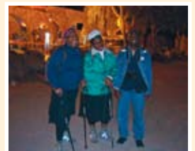
BIBS Study Tour