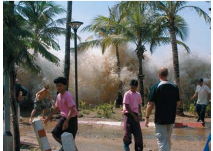
THE 2ND BIGGEST EARTHQUAKE IN RECORDED HISTORY

NEWS HEADLINE: HURRICANE KATRINA HITS NEW ORLEANS