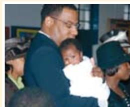
The BIBS Family